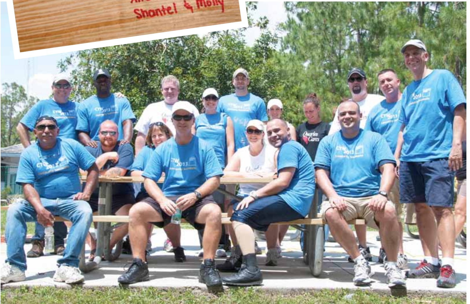
Volunteers from Goldman Sachs, Community Team Works, Wounded Warriors and Quarles & Brady