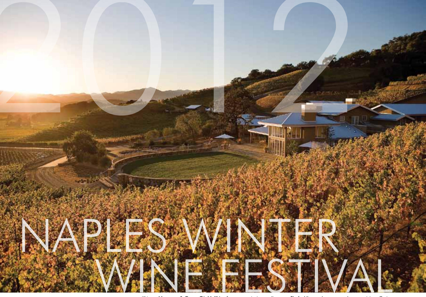
"Liters, Magnums & Cases, Oh My!" lot features an intimate dinner at Shafer Vineyards, among other exquisite offerings.