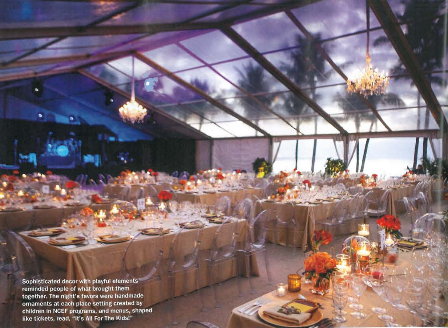
Sophisticated decor with playful elements reminded people of what brought them together. The night's favors were handmade ornaments at each place setting created by children in NCEF programs, and menus, shaped like tickets, read, "It's All For The Kids!"